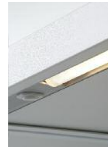
Individualized workplace lighting